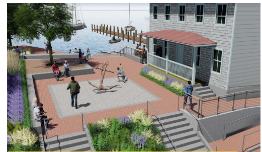
October 2024: Rendering of Burtis with Prince George Park in foreground

PARK: The Maritime Welcome Center and restoration of Burtis House provides an opportunity to activate a landscaped public park on lower Prince George Street that will create programmable outdoor space and enhance water access.