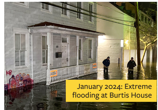
January 2024: Extreme flooding at Burtis House