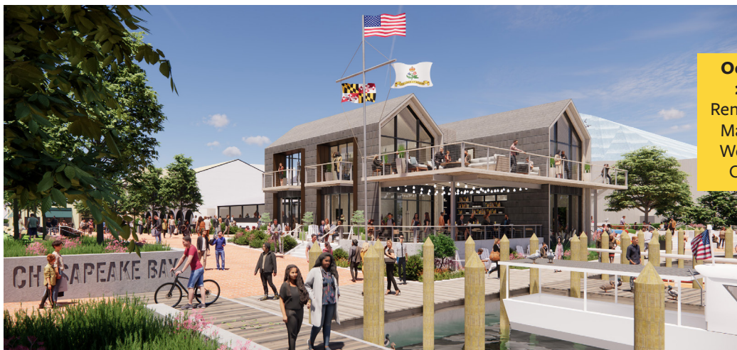
October 2024 Renderings: Maritime Welcome Center