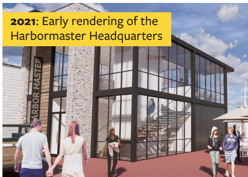
2021: Early rendering of the Harbor Master Headquarters

Learn more about City Dock Project AccessAnnapolis.com