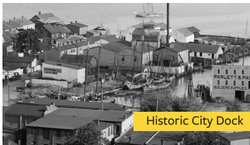
Historic City Dock

In 2019, the City of Annapolis began an extensive consultation process to shape the next chapter in the story of City Dock. Resilience and flood protection